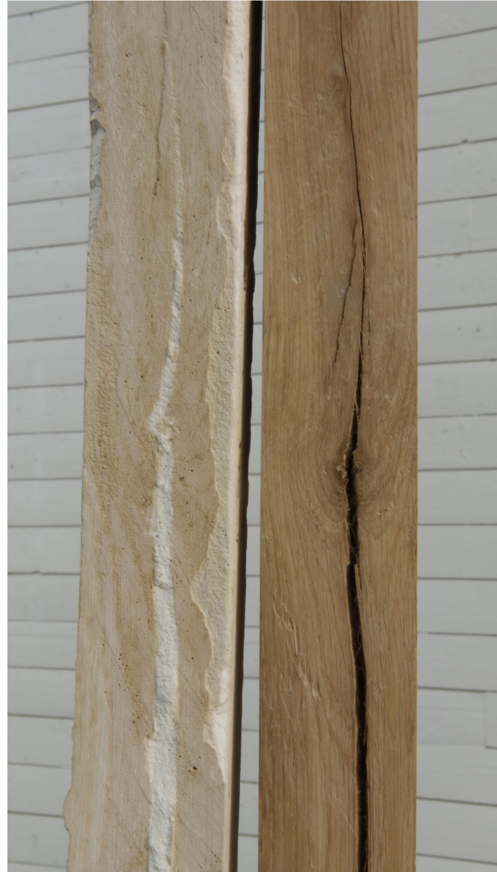
The vitality of wood, Banchao Lu, 2022 log, plaster, clay