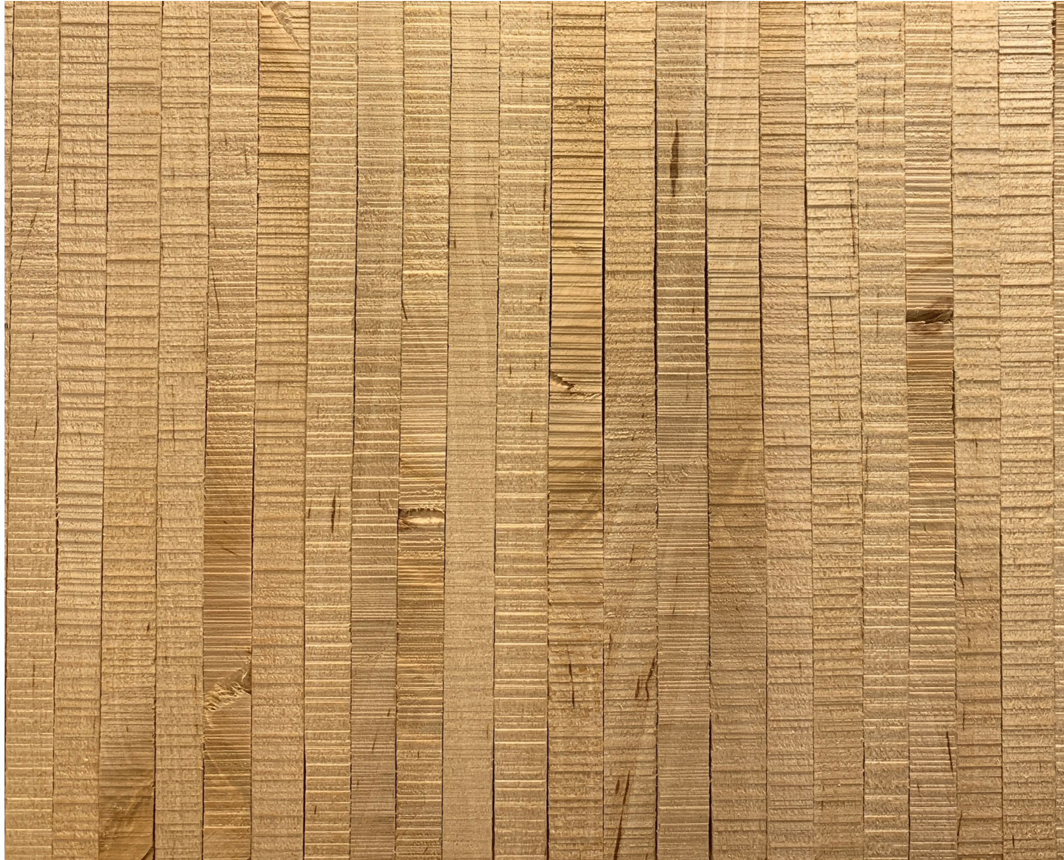
Existed beauty of the wood, Banchao Lu, 2021, Wood cut by bandsaw.