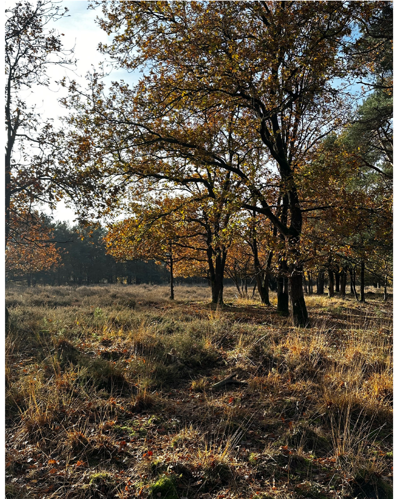
the spot of a tree, Banchao Lu, 2022