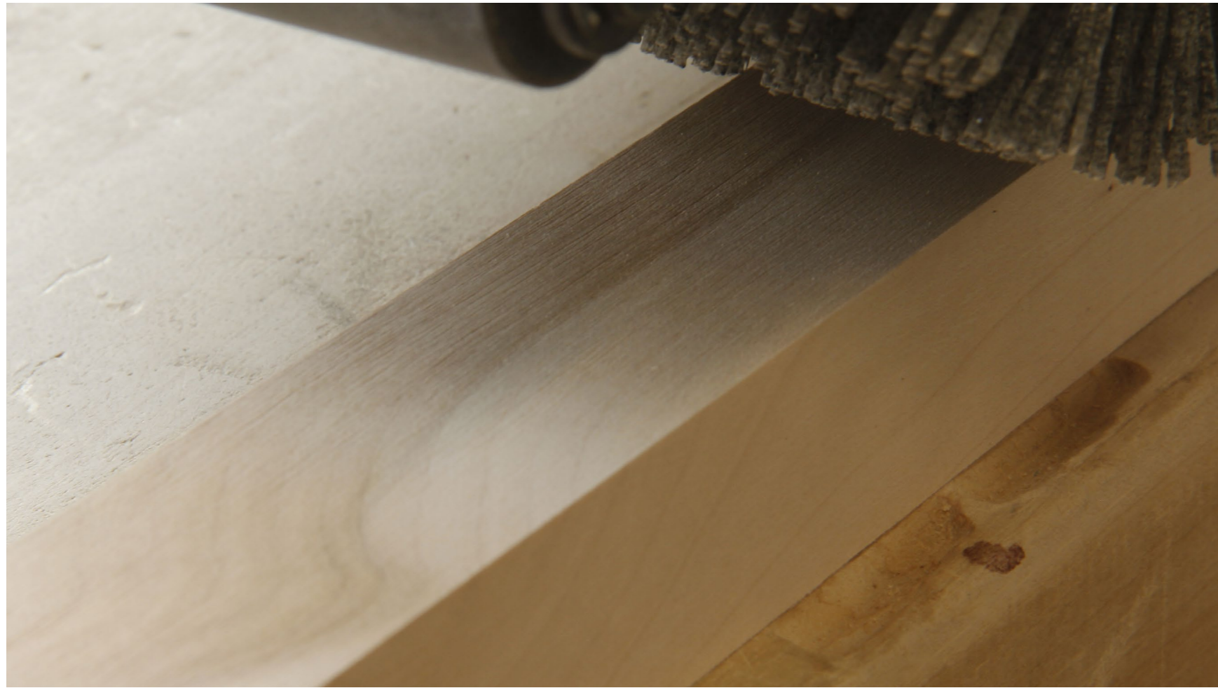
Existed beauty of the wood, Banchao Lu, 2021, Handing surface by scratching wood surface.