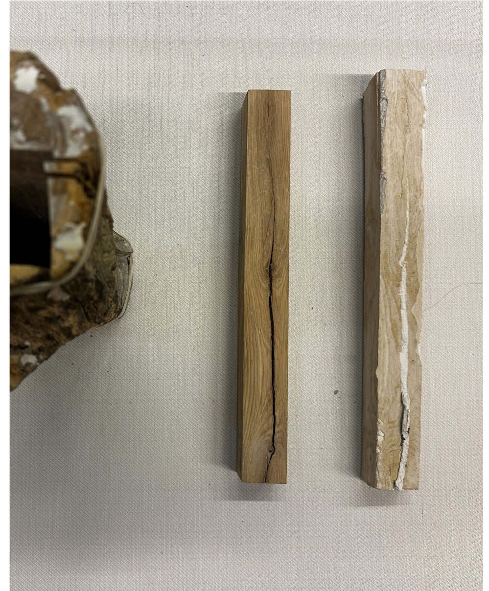
What is happening inside of a log, Banchao Lu, 2022 log, plaster, clay