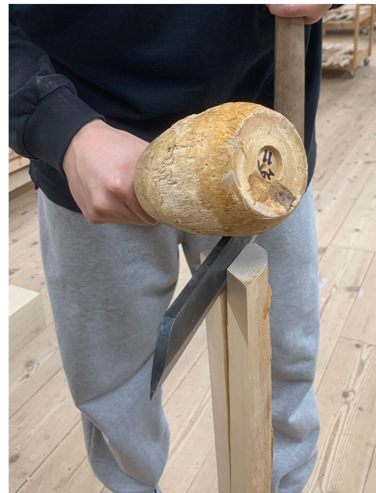
Existed beauty of the wood, Banchao Lu, 2021, Splitting, Milling wood.