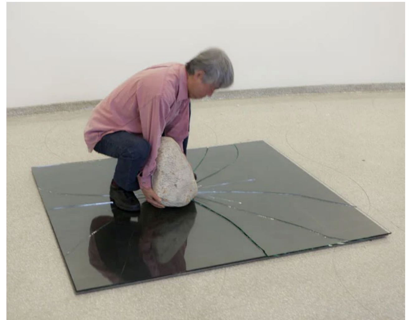
Relatum (formerly Phenomena and Perception B), 1968/2013, Lee Ufan.