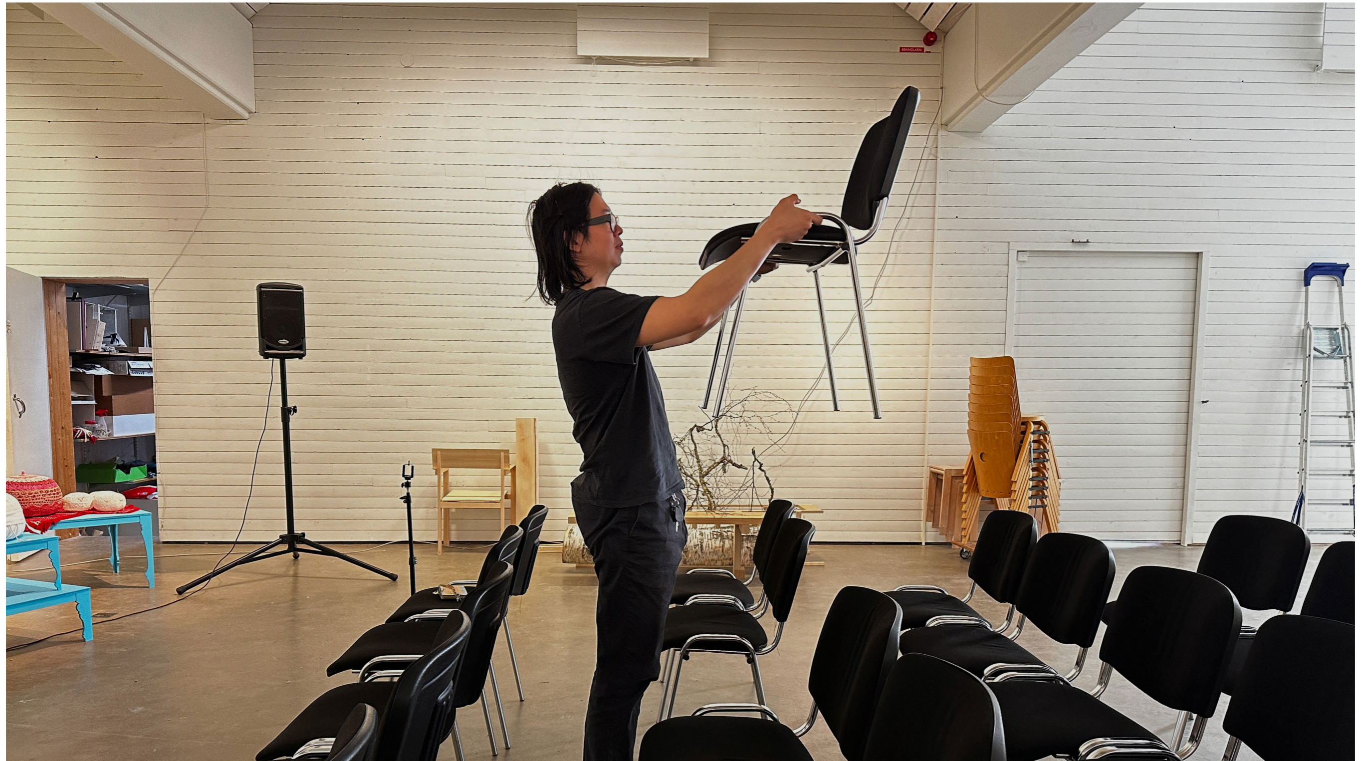
Practice of 'how to see a chair', Banchao Lu, 2023