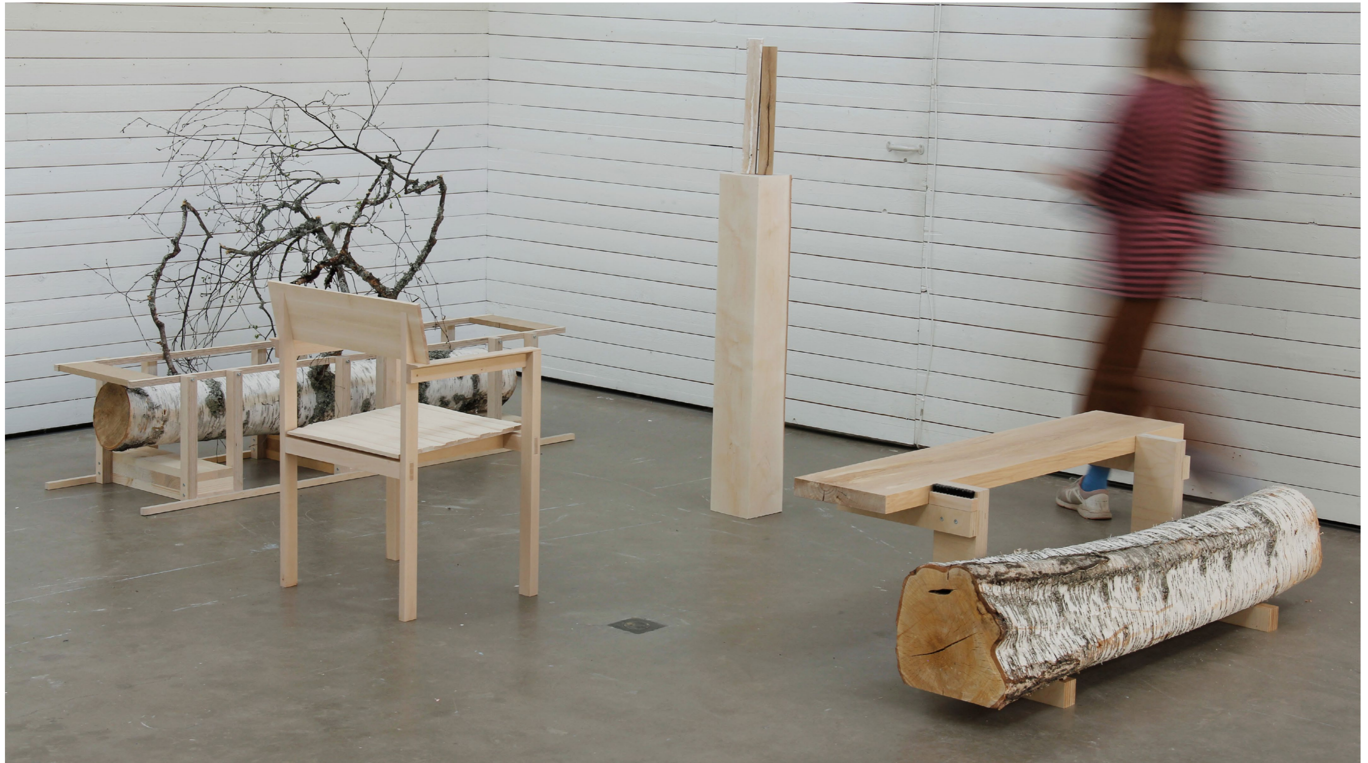
Where is the plank from ?, Banchao Lu, 2023, exhibition 'MAXI' at Konsthall Steneby.