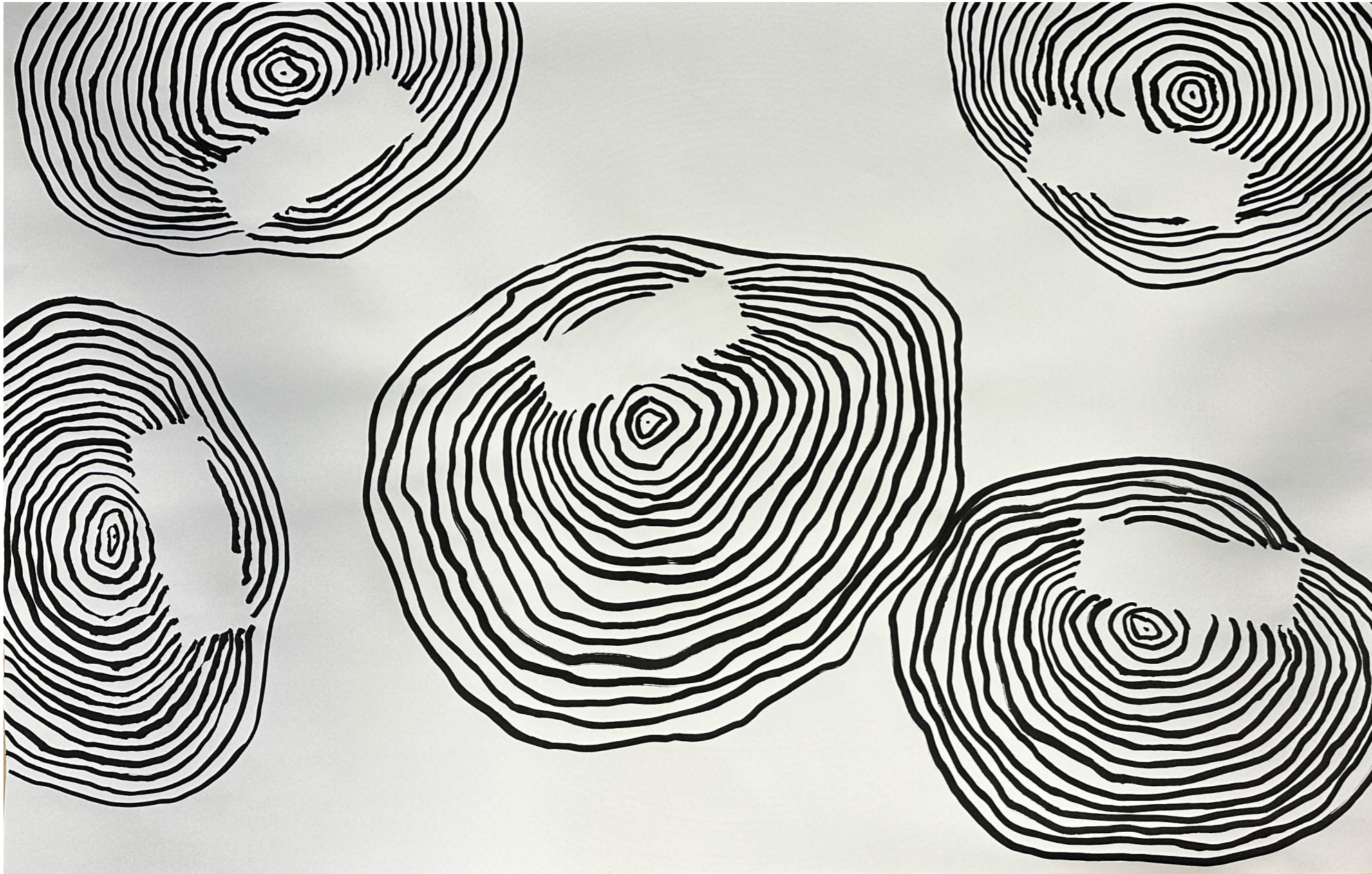
Where is the plank from, Banchao Lu, 2022 paper, calligraphy brush, ink