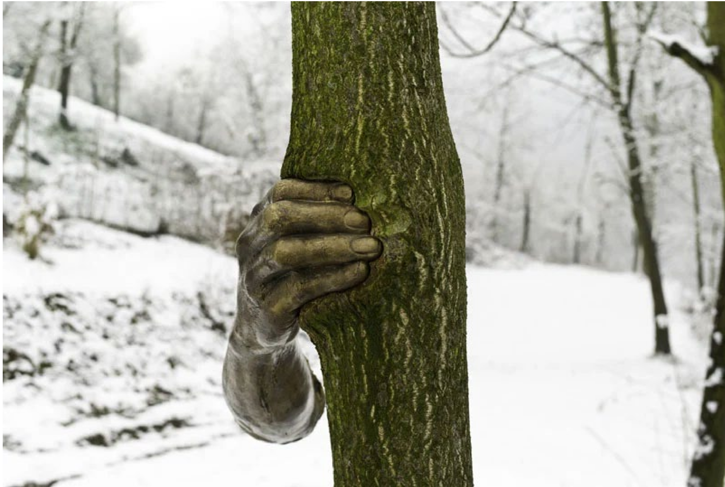
Continuerà a crescere tranne che in quel punto (1968–2003), Giuseppe Penone, tree ( Ailanthus altissima ) and bronze.