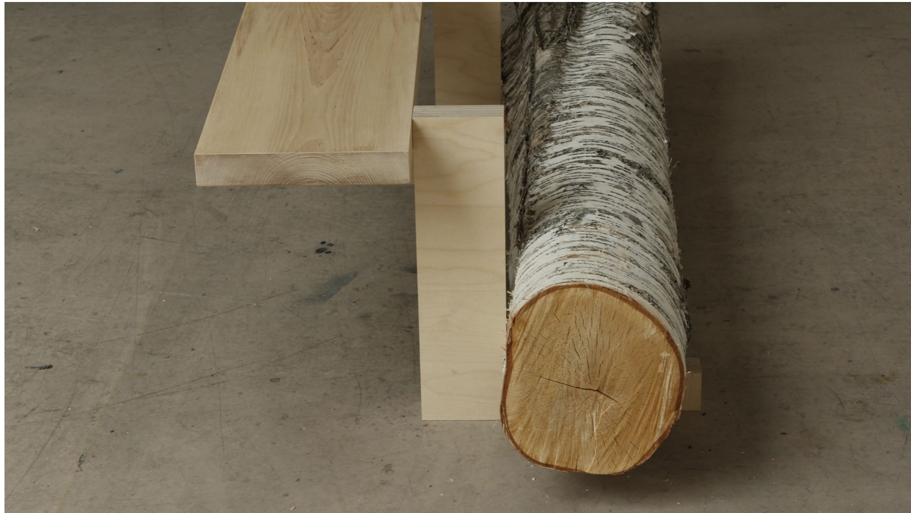
Logs and planks, Banchao Lu, 2022 log, plaster, clay