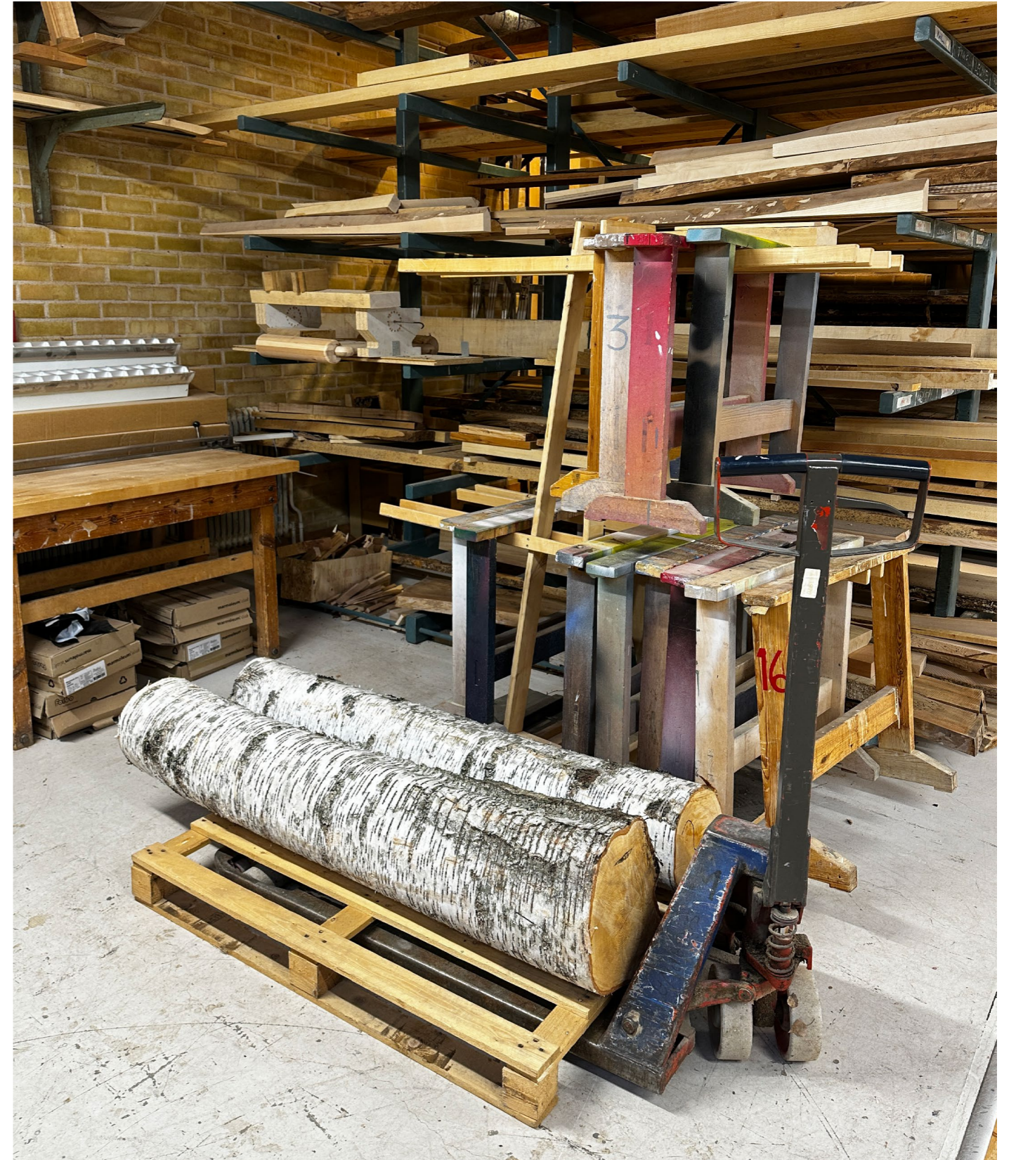
Logs and planks, Banchao Lu, 2022 log, plaster, clay