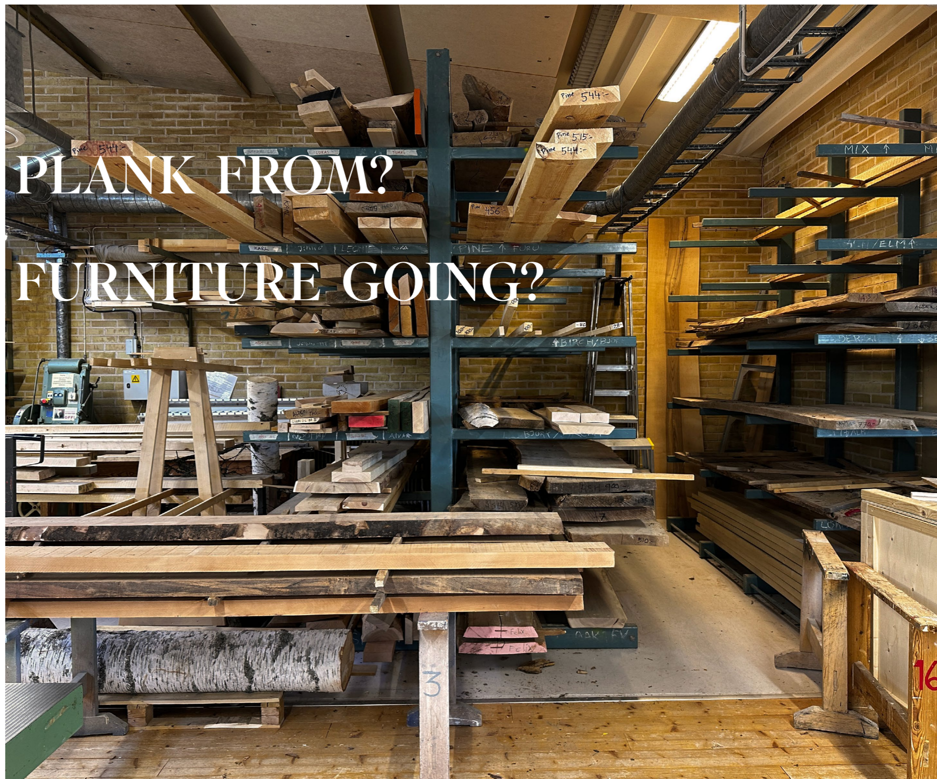
Wood workshop, Banchao Lu, 2023, HDK-Valand Steneby campus.

WHERE IS THE PLANK FROM? WHERE IS THE FURNITURE GOING?