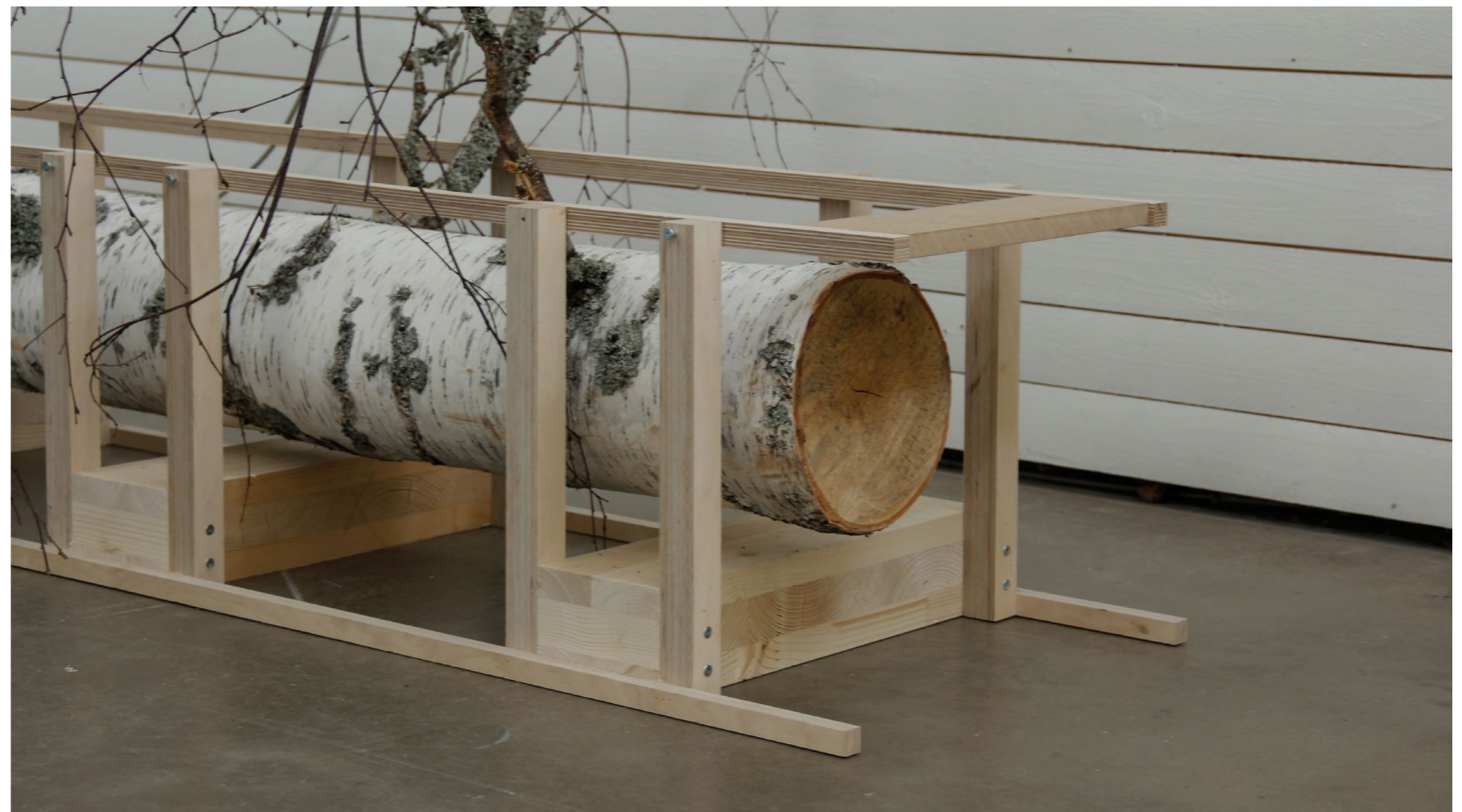
Log coffin , Banchao Lu, 2023 log, plywood, M6 screws.